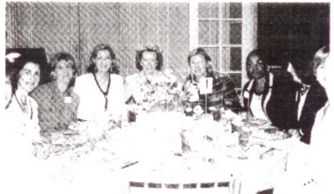
Charlotte WoV partners and guests enjoy Annual Spring Luncheon at Quail Hollow Club